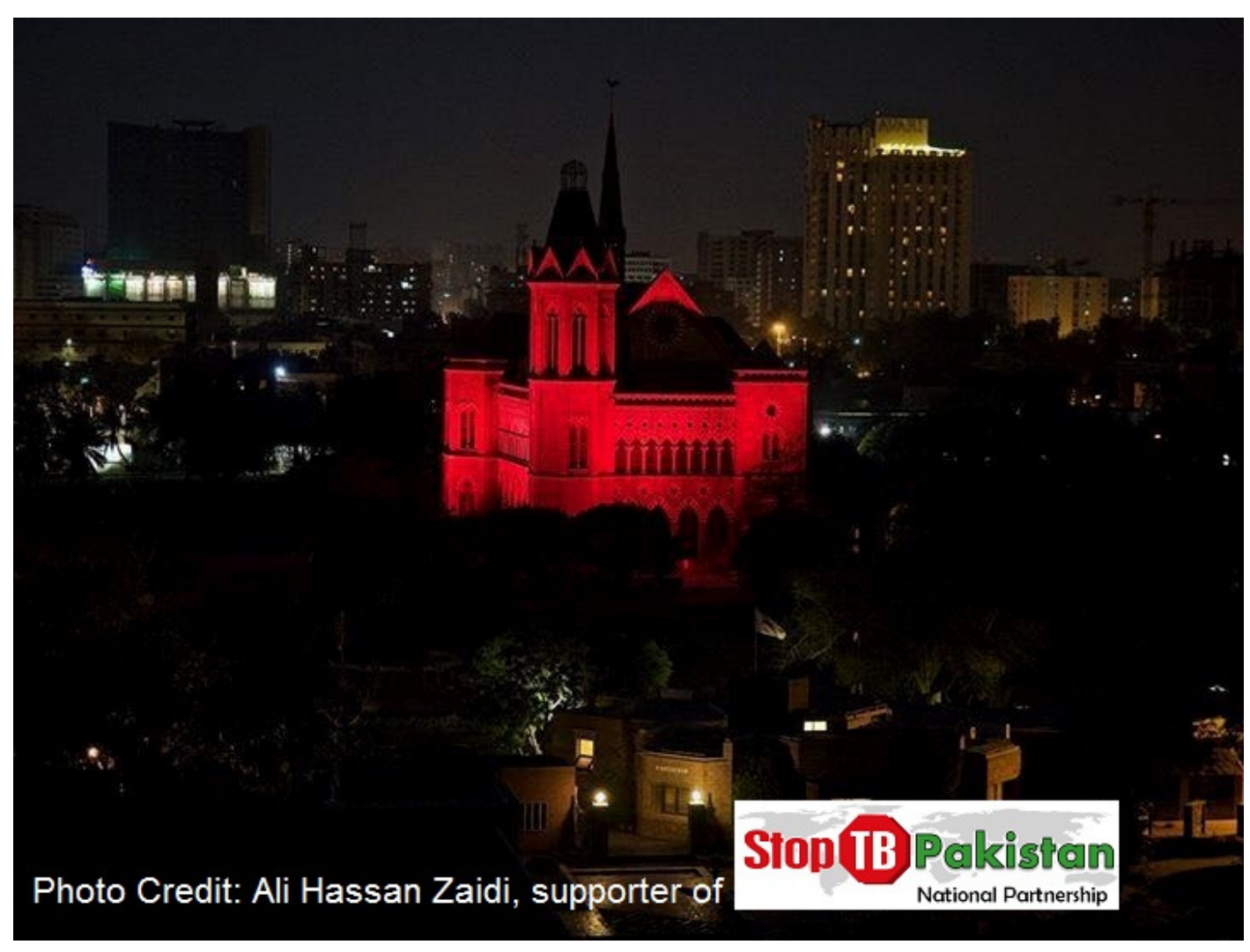
A bird eye view of Frere Hall, Karachi